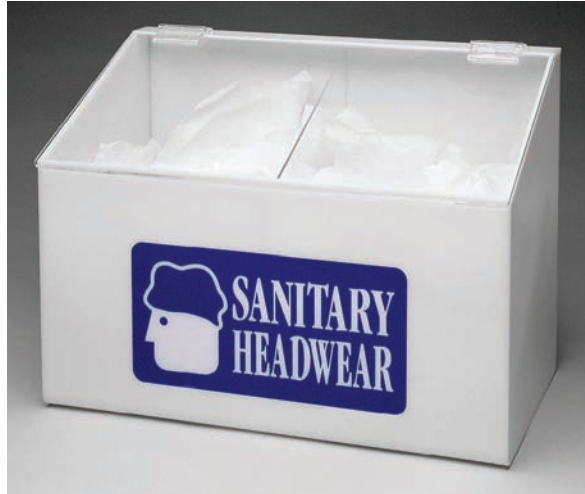
Sanitary Head Wear Dispenser (PD241E)