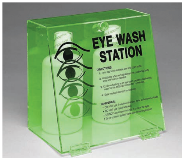
Double Bottle Eye Wash Station (PD997E)