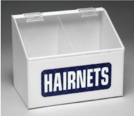
Hairnets Dispenser (PD240E)